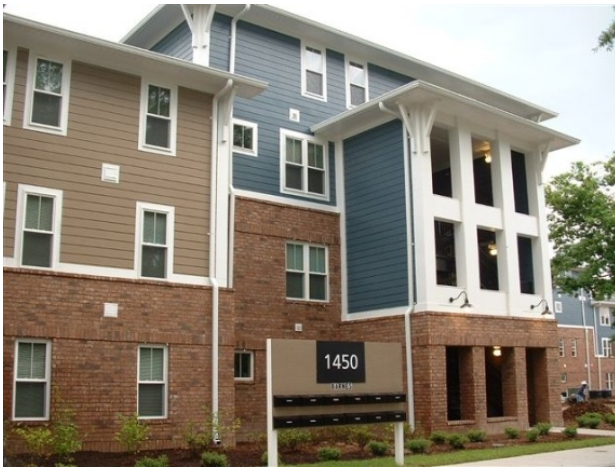
Sustainable Fellwood, Phase I

Sustainable Fellwood, located just west of Savannah's Historic District, is a 3-phase vision to transform the city's first public housing project into a vibrant mixed-income community achieving the highest standards for environmental stewardship. Phase I, which was financed just before the economic recession gained steam, safely delivered 110 housing units and became the first affordable housing community in Georgia certified by LEED for sustainable Neighborhood Development.